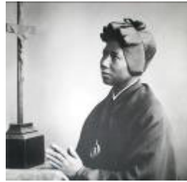
St. Josephine Bakhita